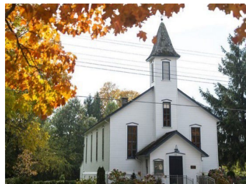
Bayfield Town Hall

To Book: Contact The Bayfield Town Hall— 519-565-5788 or visit their website http://www.bayfieldtownhall.com