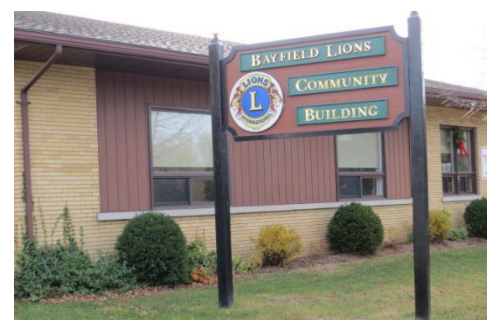
Bayfield Lions Community Building

To Book: Go to bayfieldlions.ca/room-rentals/