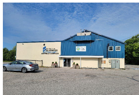
Bayfield Arena and Community Centre

To Book: Contact Bayfield Community Centre— 519-565-2121 or email info@bayfieldcommunitycentre.ca