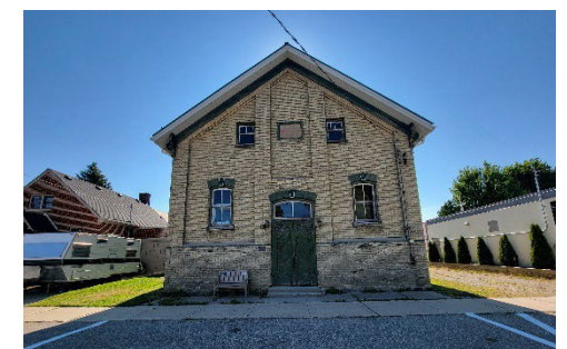
Hay Town Hall