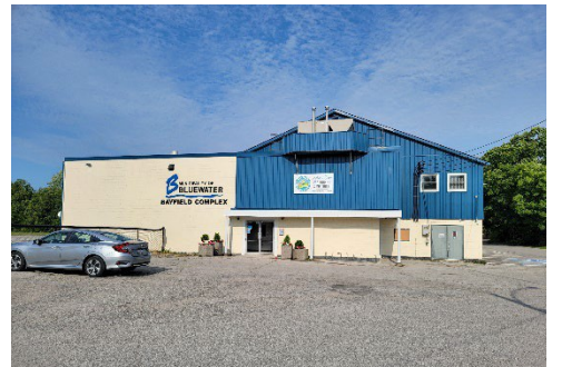
Bayfield Arena and Community Centre

To Book: Contact Bayfield Community Centre— 519-565-2121 or email info@bayfieldcommunitycentre.ca