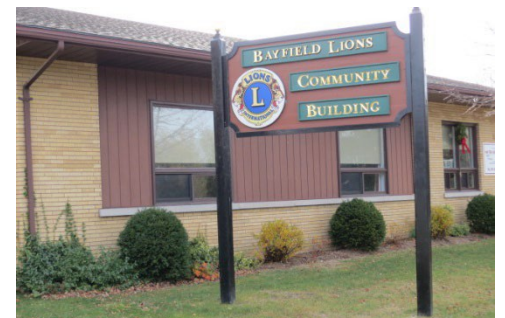
Bayfield Lions Community Building

To Book: Go to bayfieldlions.ca/room-rentals/