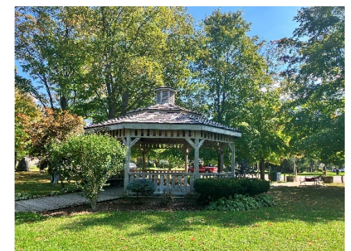
Clan Gregor Square Gazebo