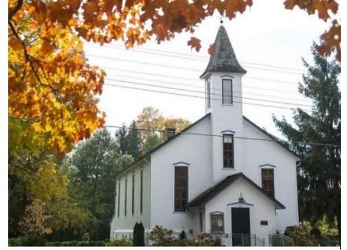
Bayfield Town Hall

To Book: Contact The Bayfield Town Hall— 519-565-5788 or visit their website http://www.bayfieldtownhall.com